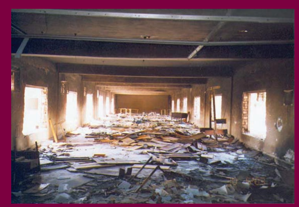
Central Library Science Reading Room, Basra University, Iraq